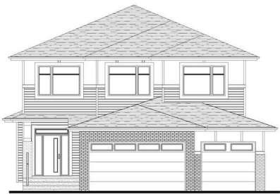
2 STOREY - 2540 SQ.FT.