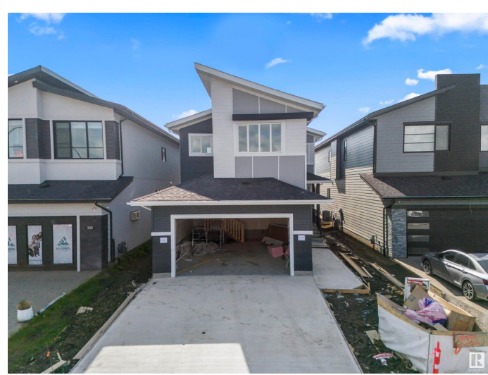
216 33 St SW, Edmonton, AB Main Floor Exterior Area 1340.56 sq ft Inherior Area 1257.77 sq ft