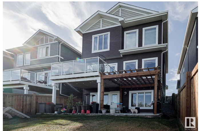
880 Ebbers Cres NW, Edmonton, AB